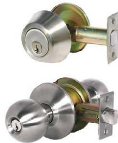
SVB / DB251 COMBO US32D Finish